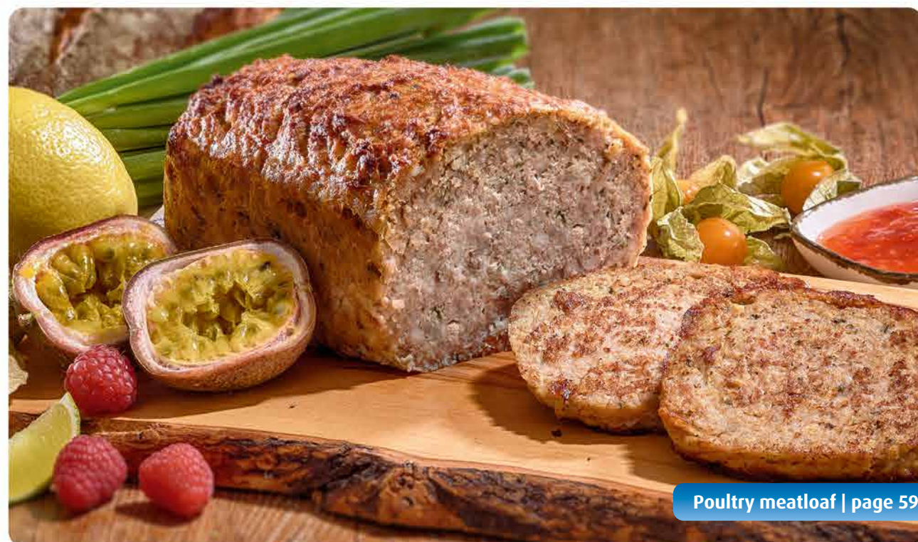
Poultry meatloaf | page 59