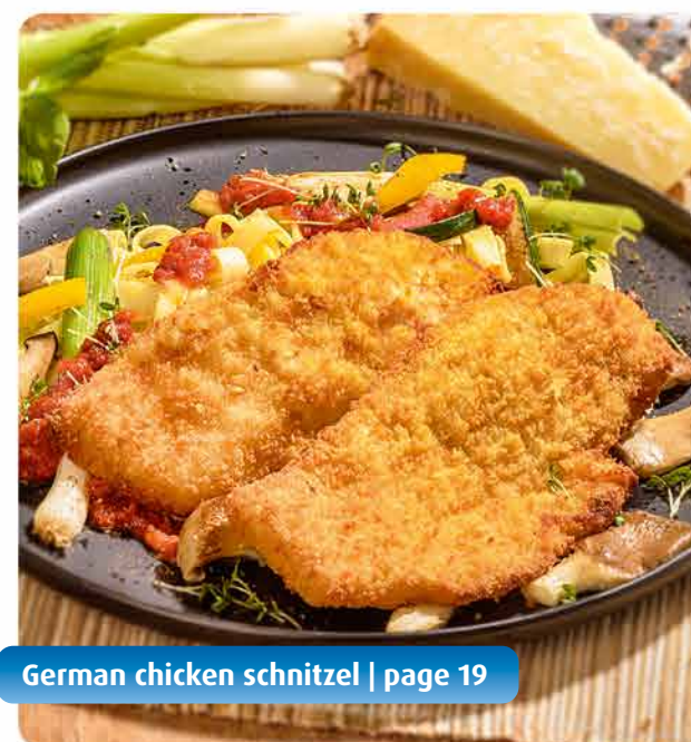
German chicken schnitzel | page 19