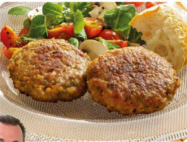
Poultry burger without onions, lightly seasoned, roasted, IQF deep-frozen

Poultry burger made with medium-fine mince and very lightly seasoned, herbs and spices scattered visibly throughout, roasted, IQF, in pillow bags