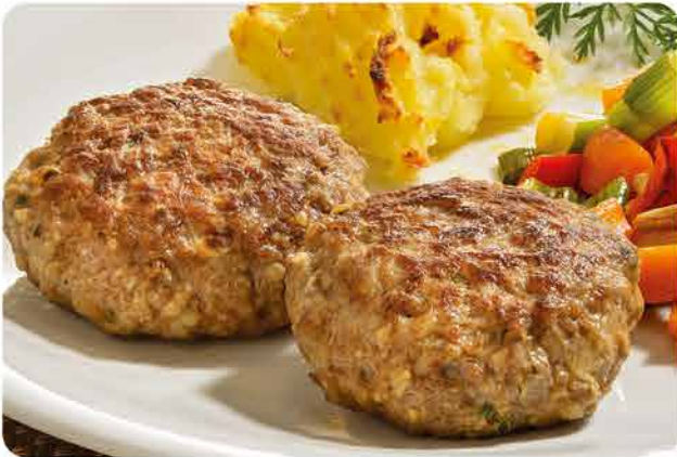
Beef mince meatballs without onions, fried, approx. 16 g, IQF deep-frozen

Small beef mince meatballs with a characteristically hearty seasoning, fried, juicy and melt-in-the-mouth, IQF, in pillow bags