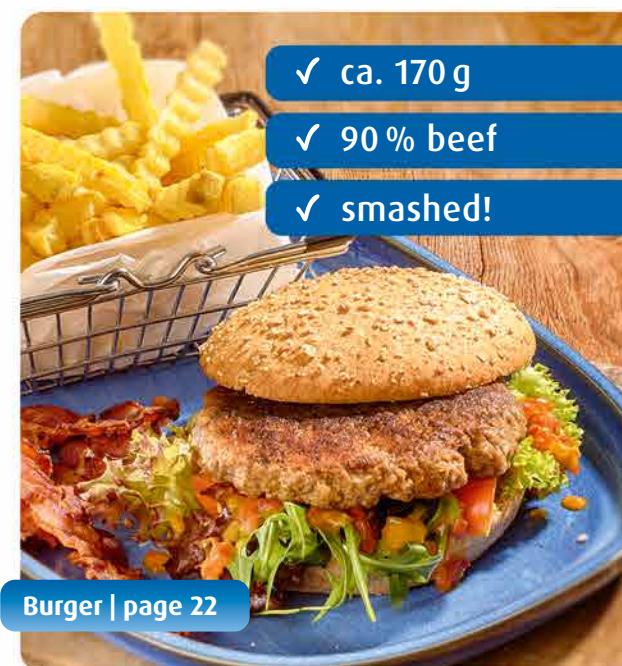
Burger | page 22