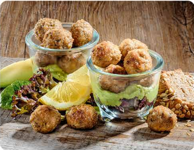
Poultry mince meatballs, without onions, lightly seasoned, fried, approx. 16 g, IQF deep-frozen

Intolerances to specific foodstuffs can occur whether in healthy persons or those with a digestive illness. This calls for a light balanced diet which differs from a normal balanced diet in terms of excluding foodstuffs or dishes that often trigger intolerances. It is also distinguished - despite these restrictions - by premium taste!