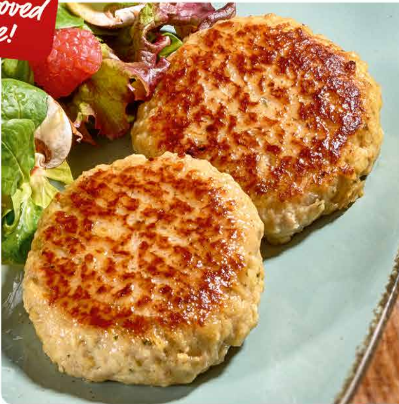
Pan-cooked burger without onions, roasted, IQF deep-frozen

Burger made of pork, minced medium-fine, mildly seasoned, without onions, herbs, parsnips and spices scattered visibly throughout, roasted, IQF, in pillow bags